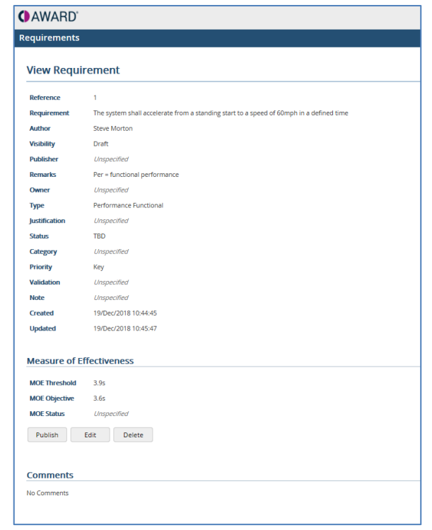
Requirement View Screen - detailed information